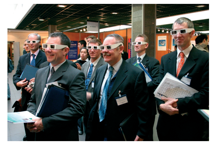
Seeing France in a new light